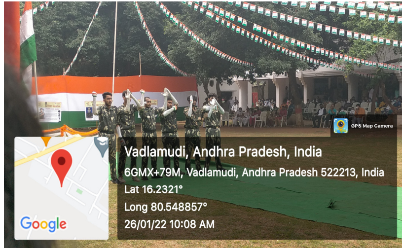
Students of dance club performing on the eve of Republic day