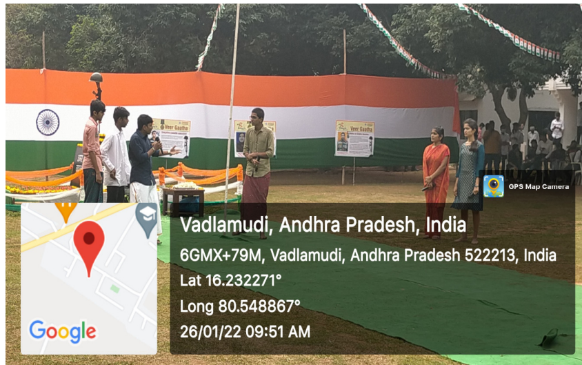
Students of theatre arts club performing an act on Right to Education