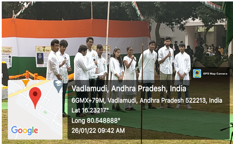
Students of music club singing a patriotic song on the eve of Republic day