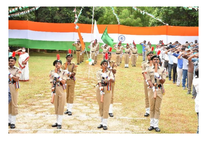
NCC Cadets giving the Guard of Honor