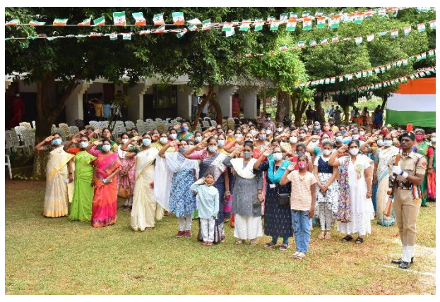
Staff and Students attending the celebrations