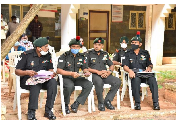
P.A Staff from 25 (A) & 10(A) Batallion