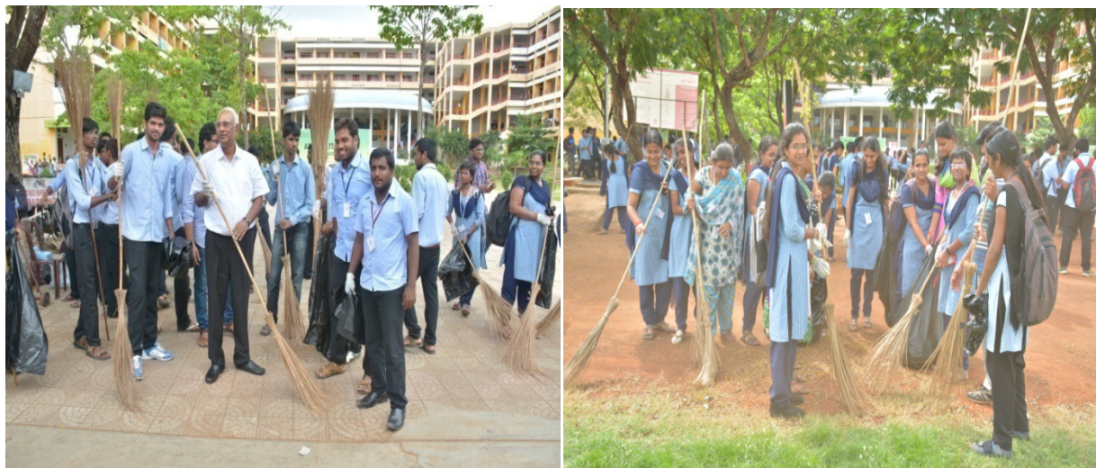
Cleaning to the surroundings of canteen (VU).

NSS Unit of Vignan's University has organized SwachhVignan Programme in University campus on 30/07/2015 between 2.10pm to 3:30pm in the prepared schedule. Their main focus was to clean the vicinity of the University canteen & surrounding grounds. The main motive of this program is to be responsible for keeping ourselves and the motivating for this should come from within and not without. Each individual has participated in this program to clean their surroundings. For this time, NSS Unit mainly concentrated on cleaning of the surroundings of canteen with the help of NSS student volunteers. In this occasion, NSS Program Officer Dr. K .V .Krishna Kishore & Asst. Registrar Mr.Gowri Shankar both said that with the help of student volunteers we have been doing this program in sparing a few hours in a day of every month for kind of work. NSS Program Officer & Asst. Registrars appreciated NSS volunteers for executing the program successfully.