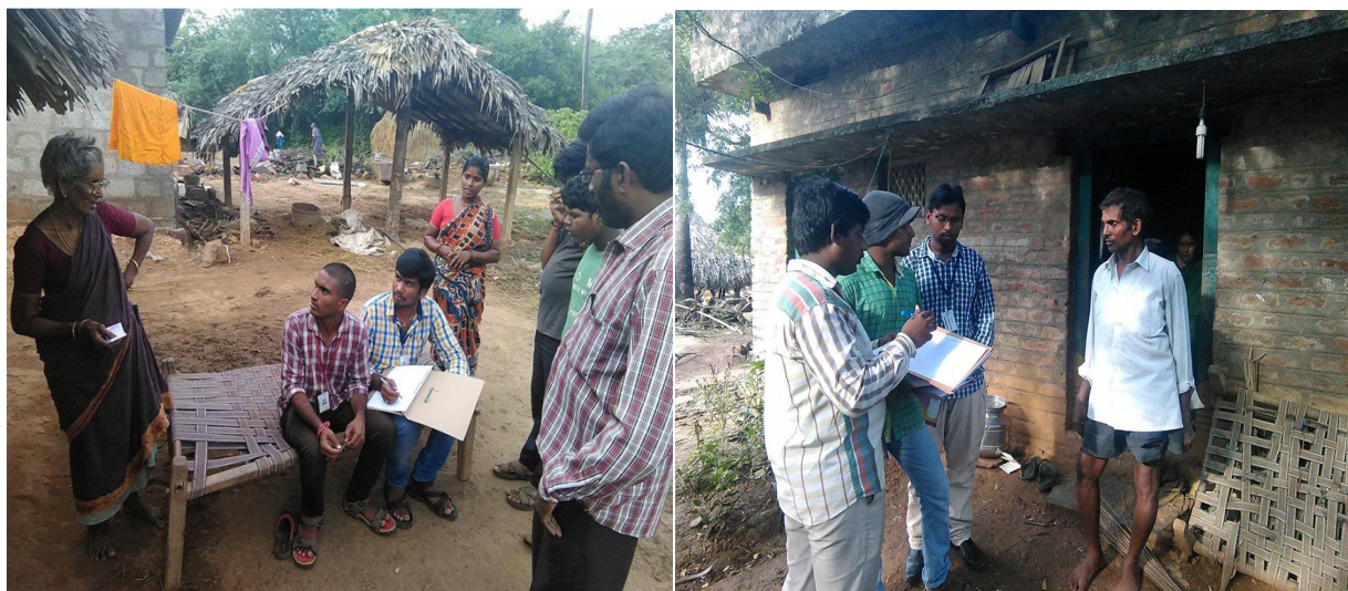
Door to door survey in Veeranayakunipalem village on 18.06.2015.

56 students of NSS Unit, Vignan's University have given their volunteer services for the village survey of Veeranayakunipalem on 18/06/2015 to 25/06/2015. In this survey all assets of village including roads, public toilets, sanitation facilities and home to home survey conducted in the village. The NSS Unit is going to conduct the survey in adapted village Veeranayakunipalem from 04:00PM to 6:00 PM for a week days