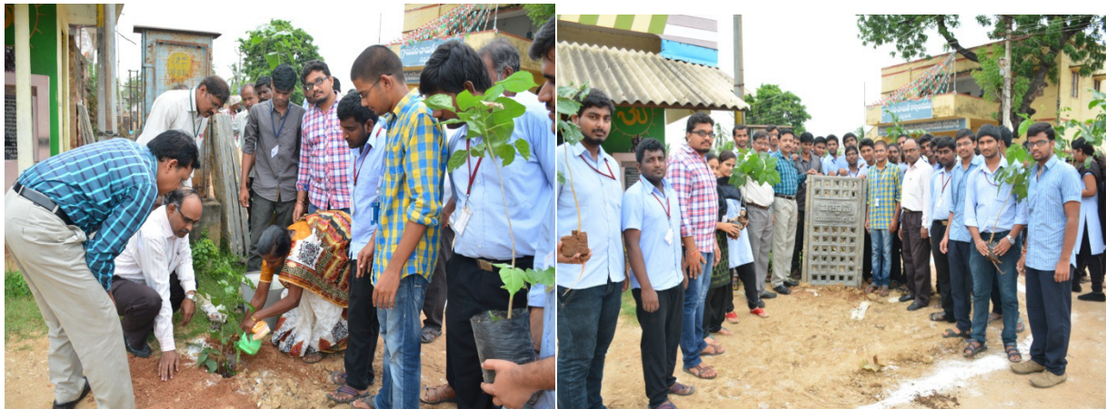
Tree plantation program in Vadlamudi village on 27.08.2016.