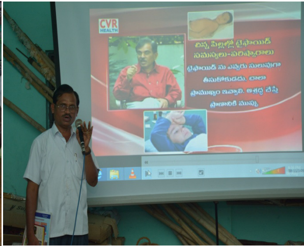
Awareness program on monsoon Health issues to rural people