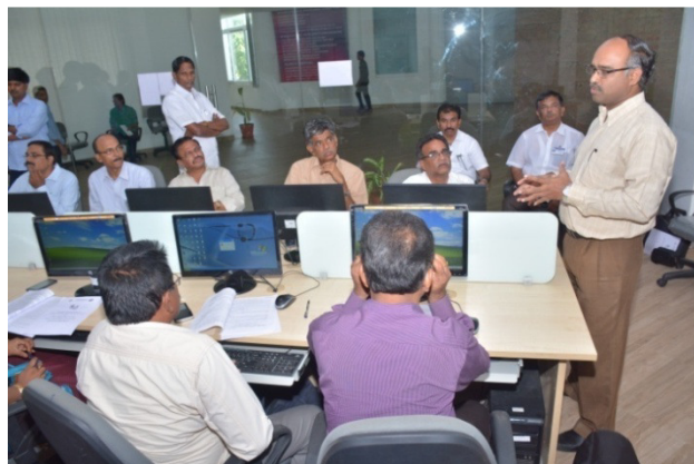
Training Program for the Principals of Govt .jr. Colleges in University premises