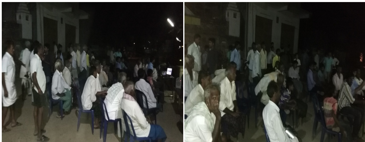
To awareness on "Farm Machinery & Organic Forming" to the local farmers by NSS Unit.