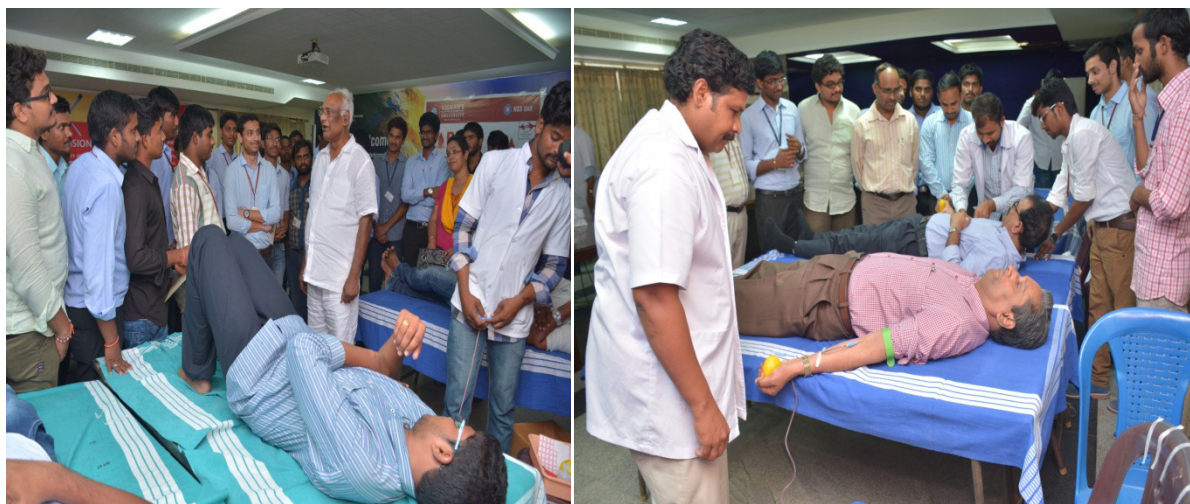
Samskruti seminar Hall