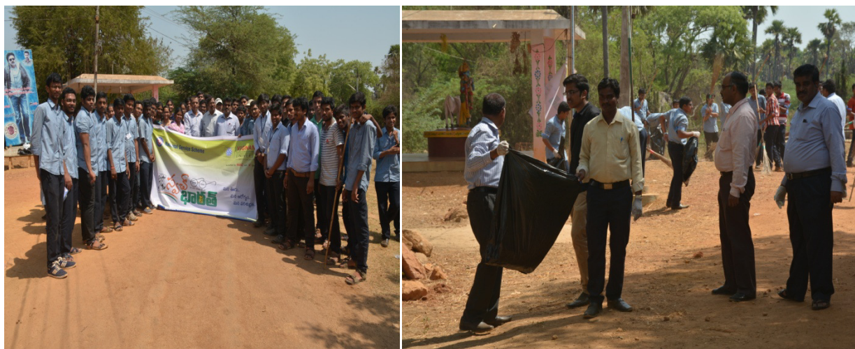
Cleaning roads in Veeranayakunipalem village.

On the same day students of II B. Tech, civil Engg Dept organized an awareness program on the conservation of water on the occasion of "World Water Day" i.e. 22.03.2016. The program was held at Veeranayakunipalem village. Awareness created among the villagers regarding the usage and conservation of water. NSS students educated them on rain water harvesting usage of water tank sensors which stop the overflow of water tank etc. It was door to door awareness program.